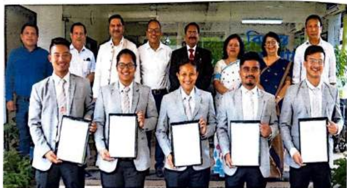
Figure 5: First batch of PGDSC students of SASU.

Overall, the ceremony was a grand success and marked a significant milestone in the academic journey of the students who received their PGDSC diplomas.