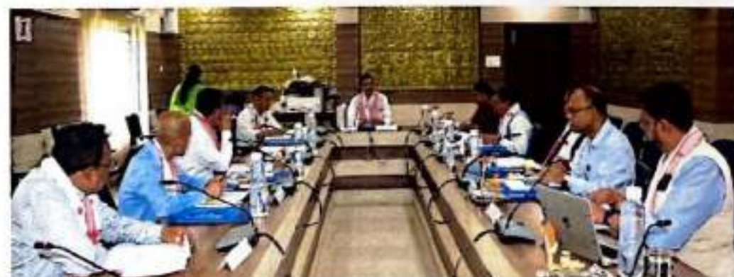
Figure 2: The fourth meeting of the Executive Council of SASU held on 22nd April 2022.