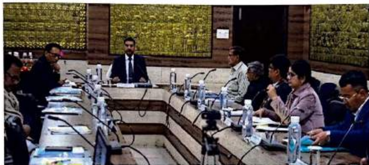
Figure 1: The first meeting of the Sri Sri Aniruddhadeva Sports University Court held on 7th January 2023.