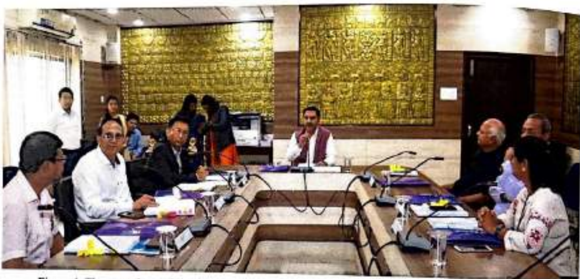
Figure 4: The seventh meeting of the Academic & Activity Council of SASU held on 11th April 2022.

Following the release of the First Statutes of the Sri Sri Aniruddhadeva Sports University, the