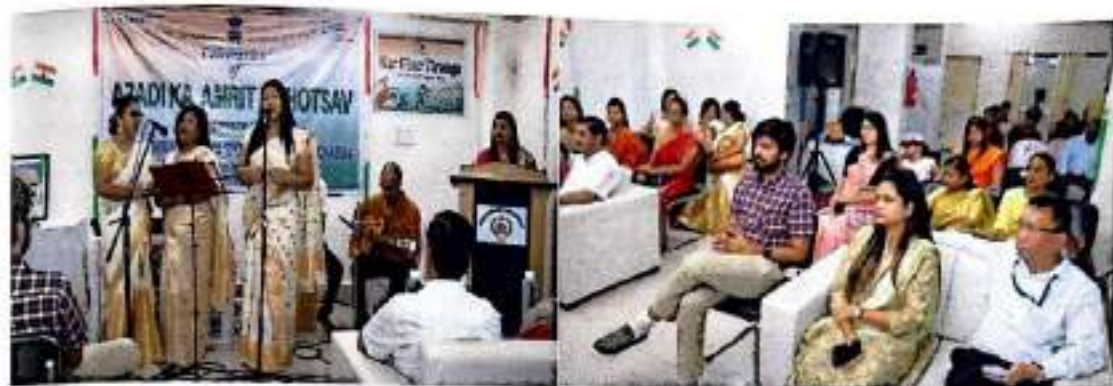
Celebration of 76th Independence Day